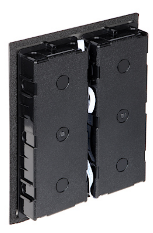
Internal view, after remove the cover:

Code: S1532A VIDEO DOORPHONE S1532A VIDOS