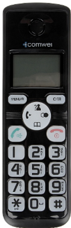
Rear view (place for battery):