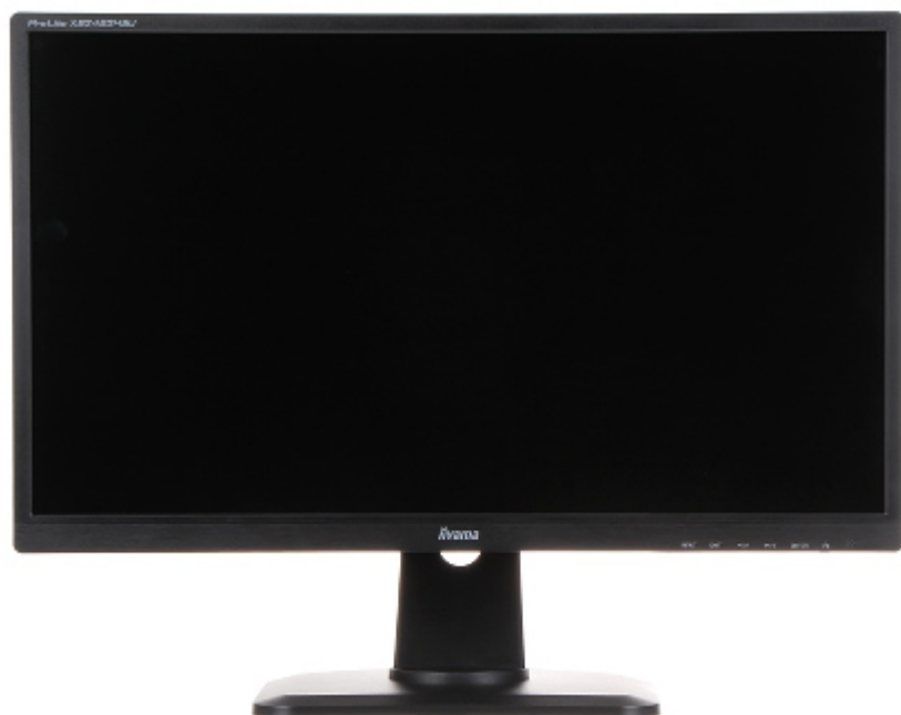
OSD menu control keys: