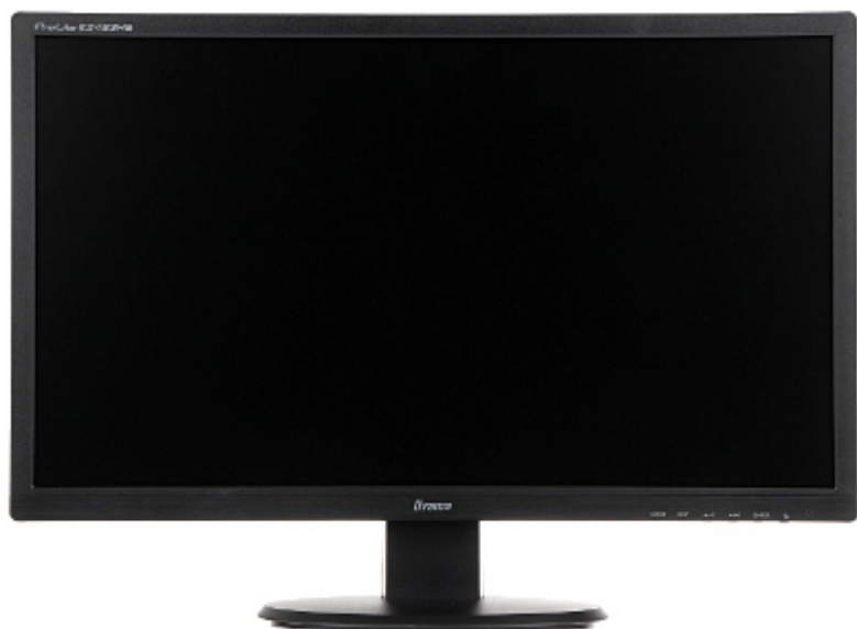
OSD menu control keys: