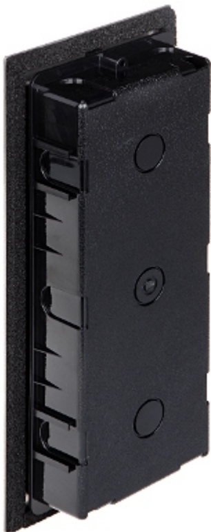
Internal view, after remove the cover: