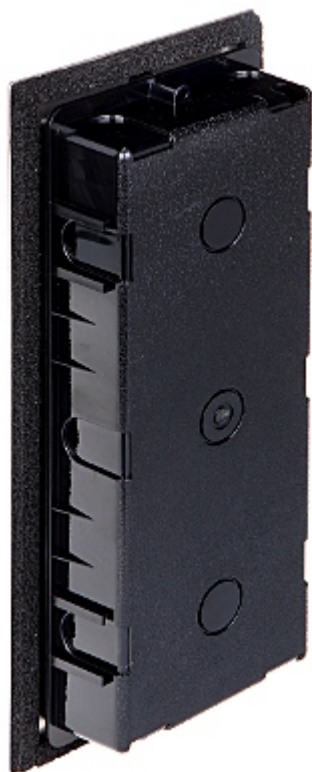
Internal view (after open the enclosure):