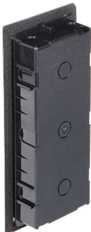
Internal view, after remove the cover: