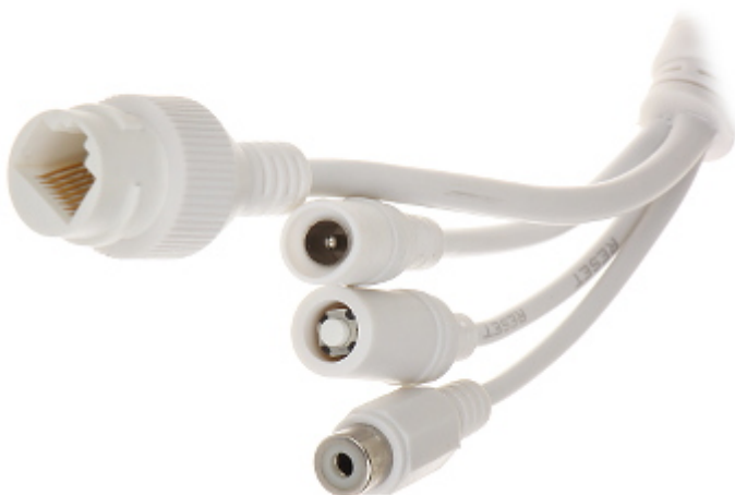
Camera mounting dimensions: