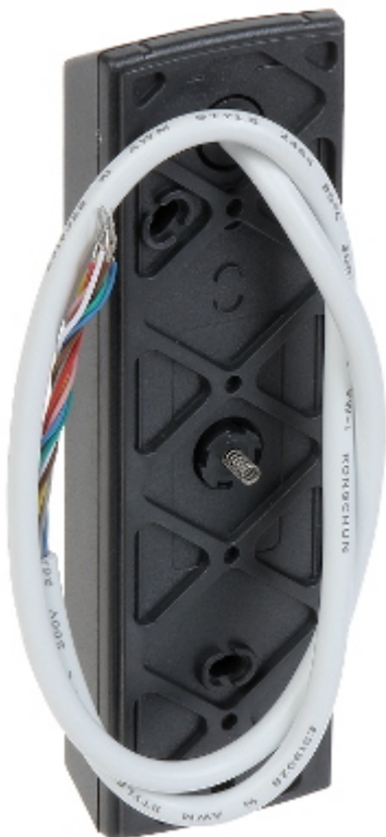
Internal view, after remove the cover: