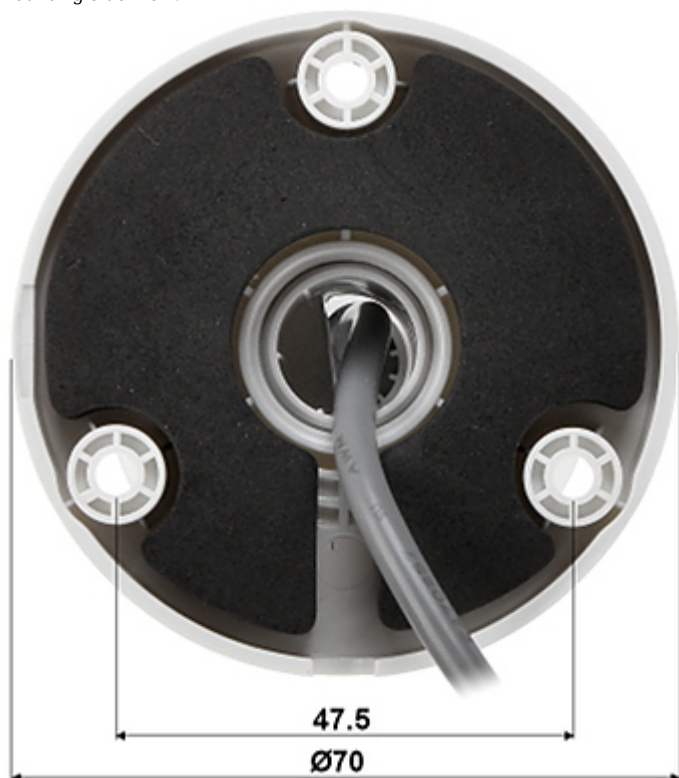
Camera and bracket dimensions: