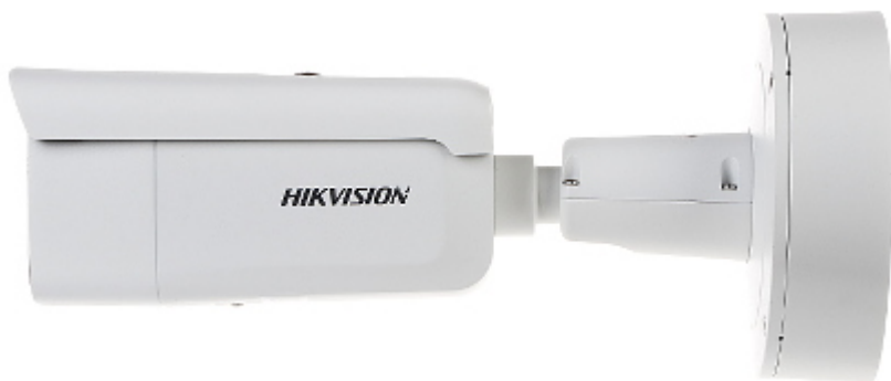
Memory card slot: