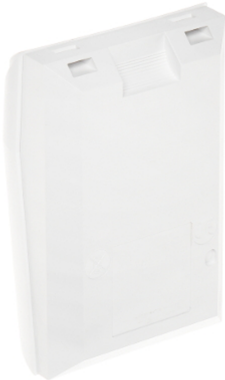
Description of particular elements of the device