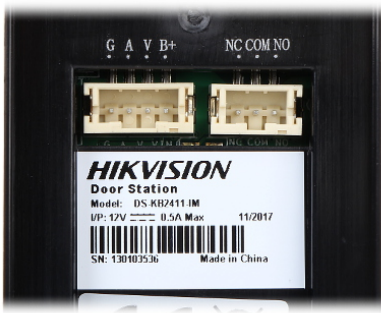
INDOOR PANEL: Front view: