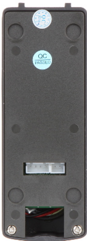
INDOOR PANEL: Front view: