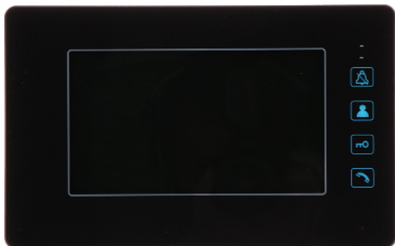
Monitor control keys: