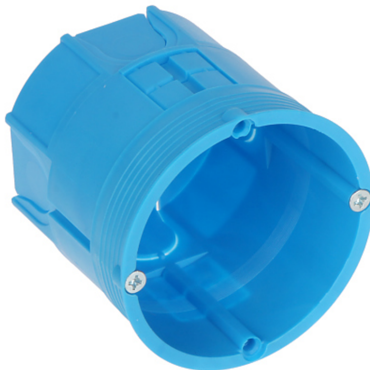
Flush mounting box. The box is made from non-halogen, self-extinguishing plastic.

The device must be secured against contact with caustic, staining and viscous fluids.