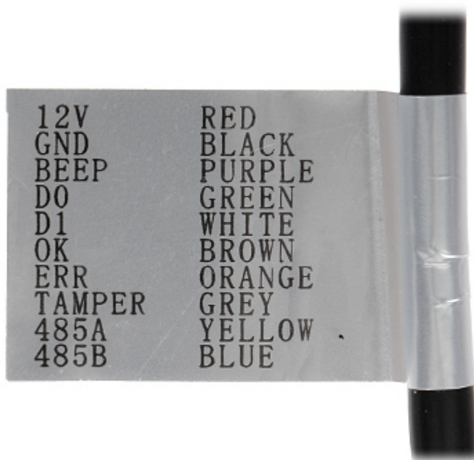
In the kit: