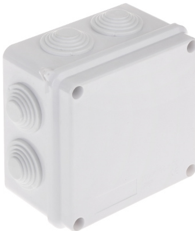
Surface mounting box, insulation, branching, 7-intake with non-threaded cable glands.

The device must be secured against contact with caustic, staining and viscous fluids.