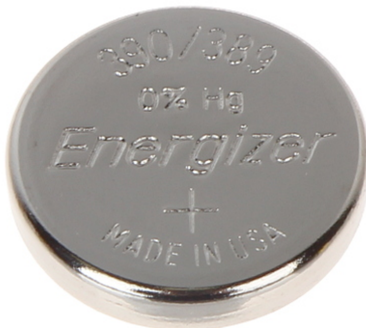
Energizer silver oxide battery.

The device must be secured against contact with caustic, staining and viscous fluids.