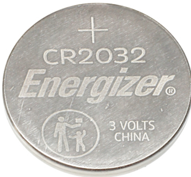
Energizer lithium battery.

The device must be secured against contact with caustic, staining and viscous fluids.