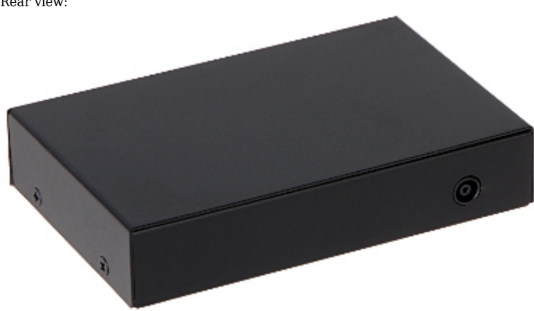
5 - LAN Rear view:

User Manual Code: DH-PFS3006-4ET-60 SWITCH POE DH-PFS3006-4ET-60 6-PORT DAHUA