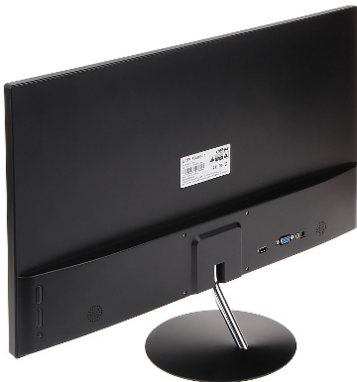
OSD menu control keys: