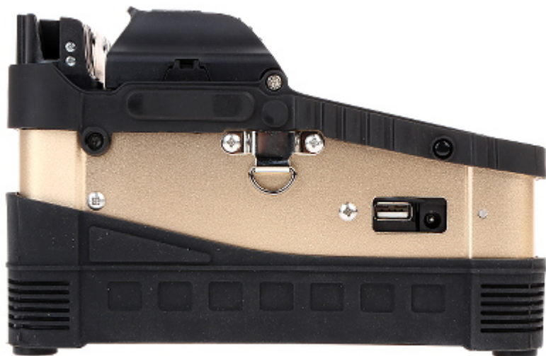
Fiber cleaver tool: