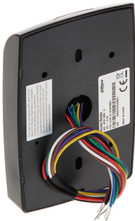
Internal view, after remove the cover: