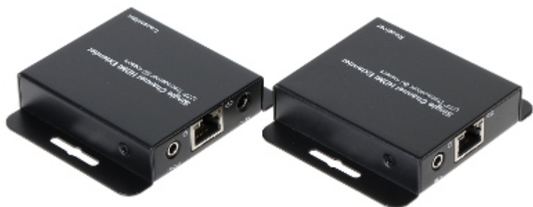
Transmitter and receiver connectors: