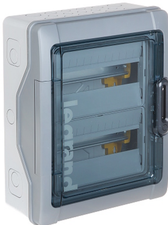
2-row 24-modular surface-mounting, hermetic distribution electric cabinet.

The device must be secured against contact with caustic, staining and viscous fluids.