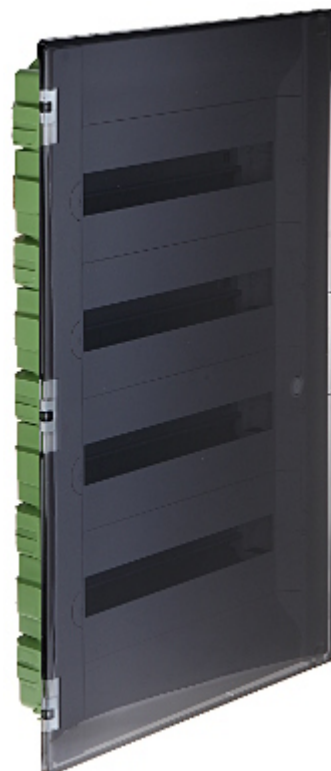
4-row 72-modular flush-mounting distribution electric cabinet.

The device must be secured against contact with caustic, staining and viscous fluids.