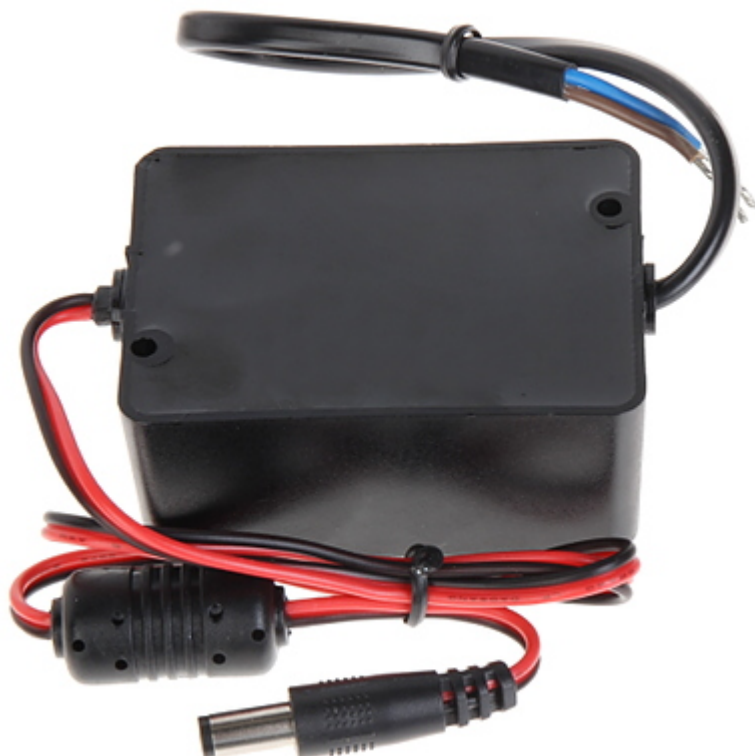
2.1/5.5mm plug polarization: