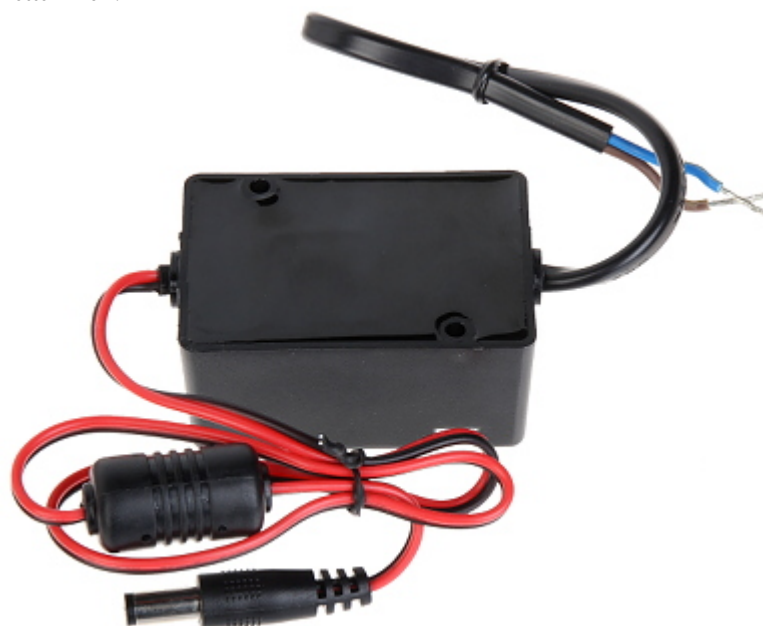
2.1/5.5mm plug polarization: