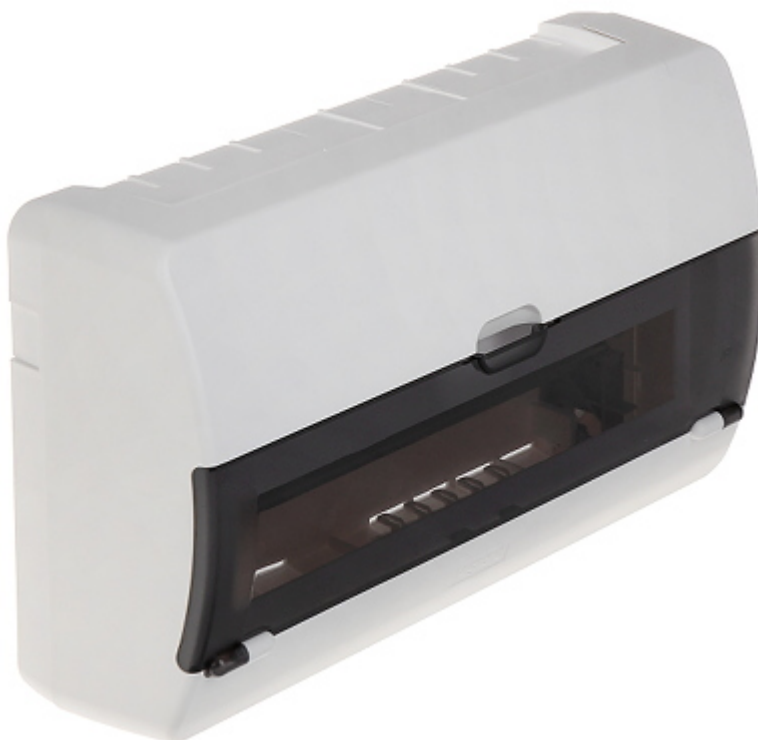
1-row 16-modular surface-mounting distribution electric cabinet.

The device must be secured against contact with caustic, staining and viscous fluids.