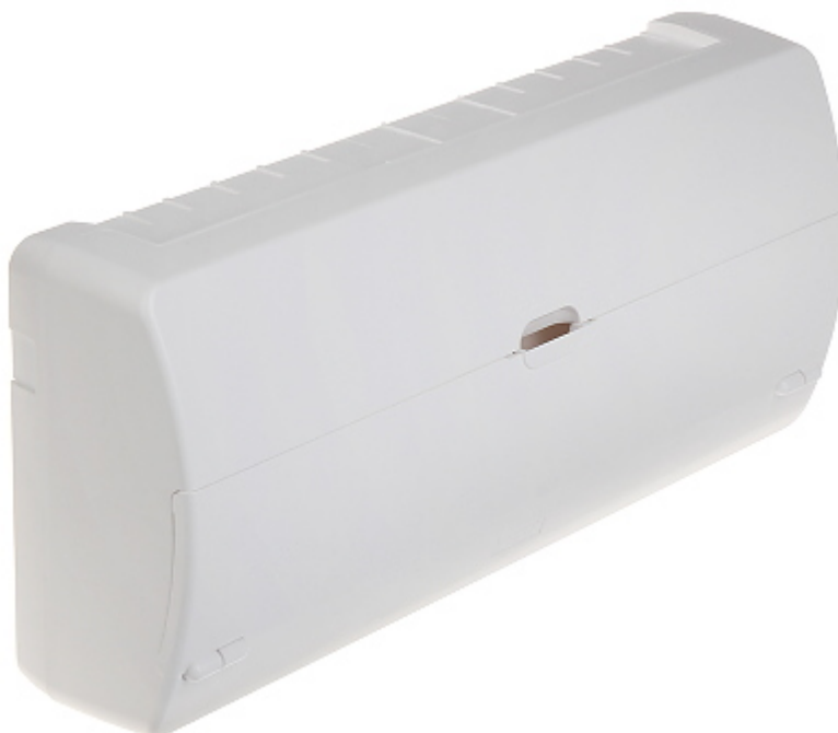
1-row 22-modular surface-mounting distribution electric cabinet.

The device must be secured against contact with caustic, staining and viscous fluids.