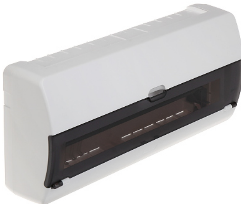
1-row 22-modular surface-mounting distribution electric cabinet.

The device must be secured against contact with caustic, staining and viscous fluids.