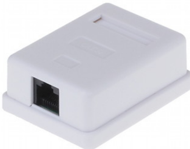
Surface outlet with connector.

The device must be secured against contact with caustic, staining and viscous fluids.