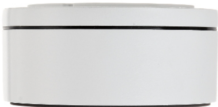
View without the front cover: