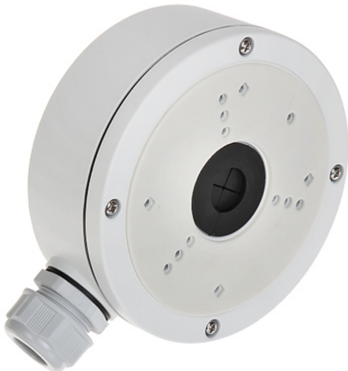
View of the ceiling mounting side: