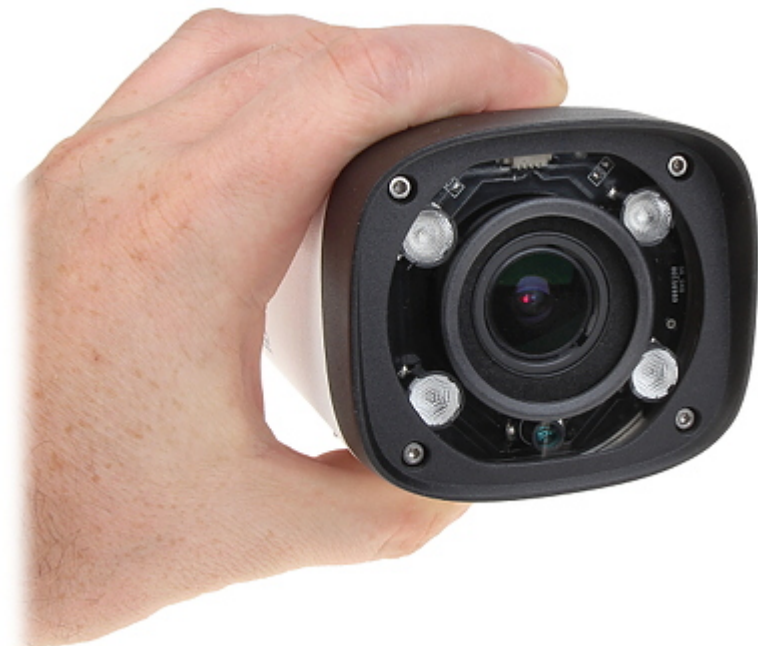
Bottom view (after remove the cover):