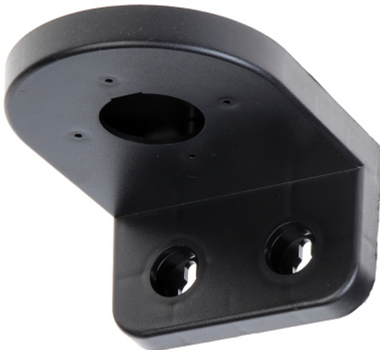
Wall bracket. Designed to dome cameras.

The device must be secured against contact with caustic, staining and viscous fluids.