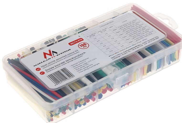
The set of heat-shrinkable tubing.

The device must be secured against contact with caustic, staining and viscous fluids.