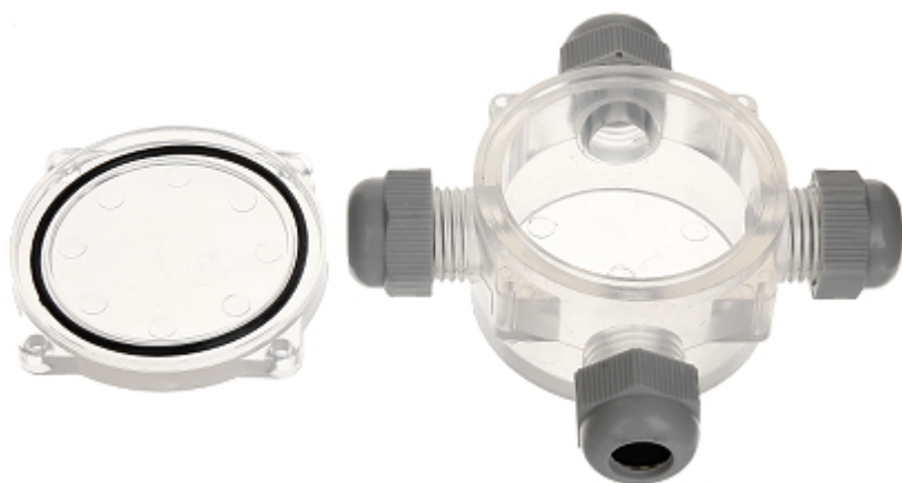
In the set - the product has 2 types of sealing rubbers: