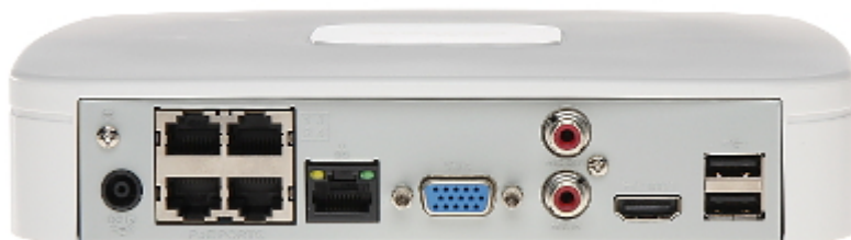
In the kit: