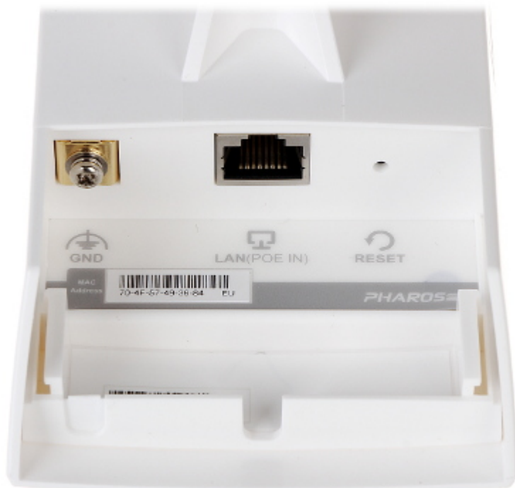
PoE Power Supply and Adapter: