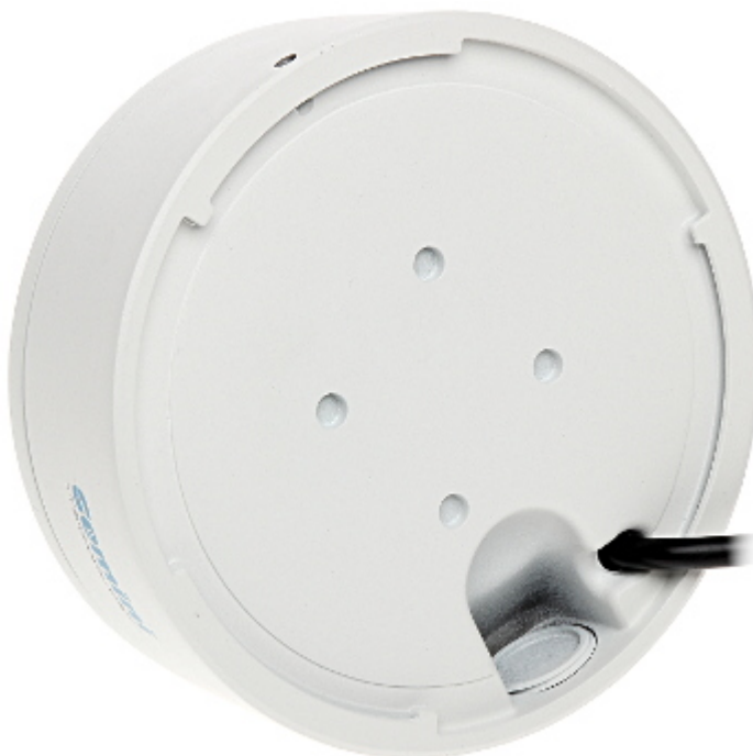
Camera mounting dimensions: