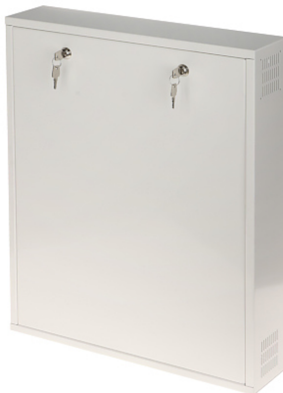
Housing designed to safe DVRs storage.

The device must be secured against contact with caustic, staining and viscous fluids.