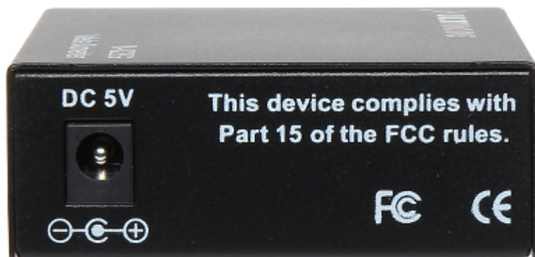
Example of device using: