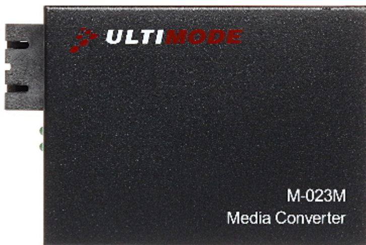
Example of device using: