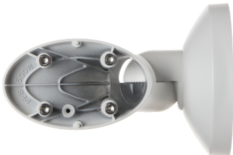
Bracket wall mounting base dimensions: