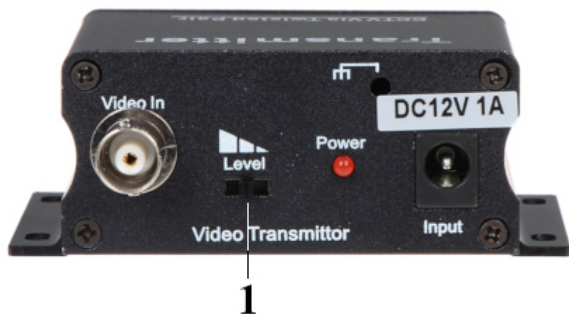
1. Initial signal correction Rear view: