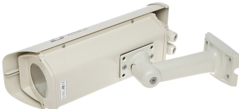
Wall mounting side view: