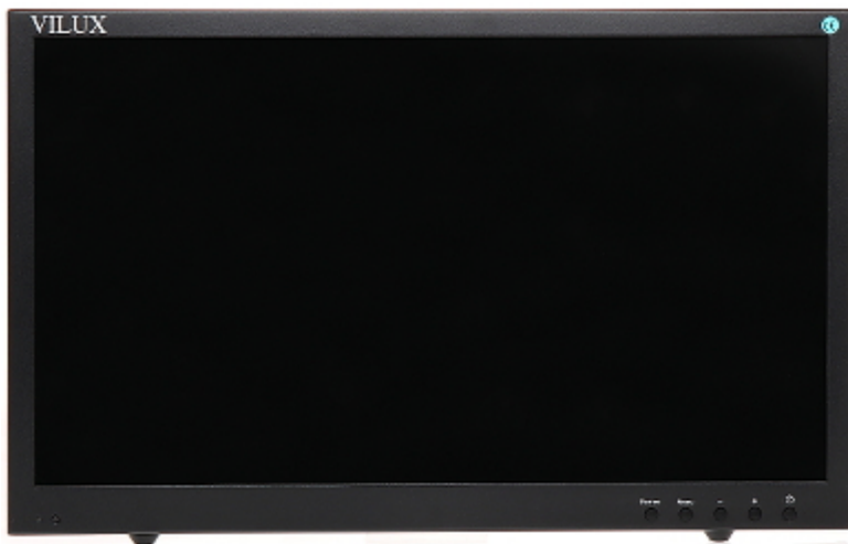
OSD menu control keys: