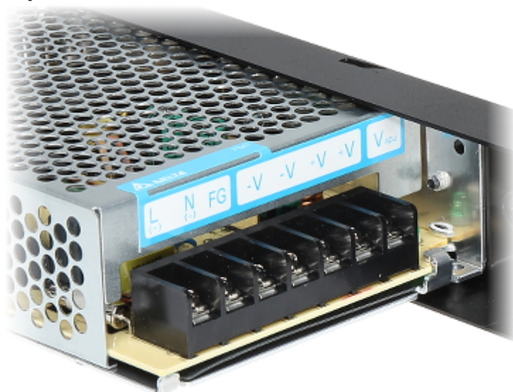
Input voltage switch: