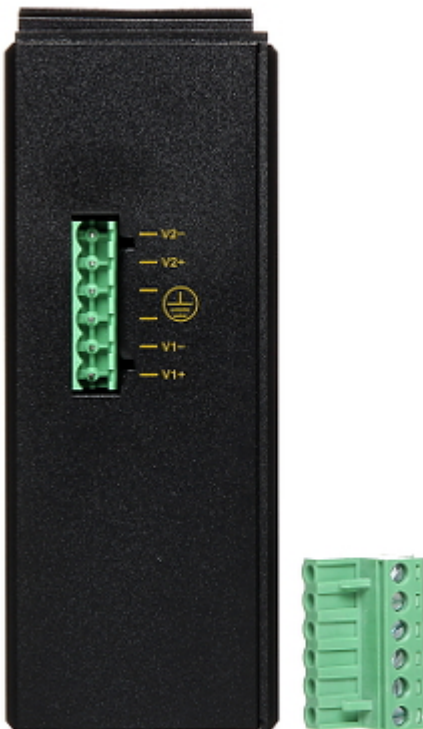
Rear panel (DIN rail installation):