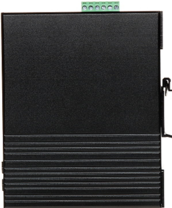
Example of application: